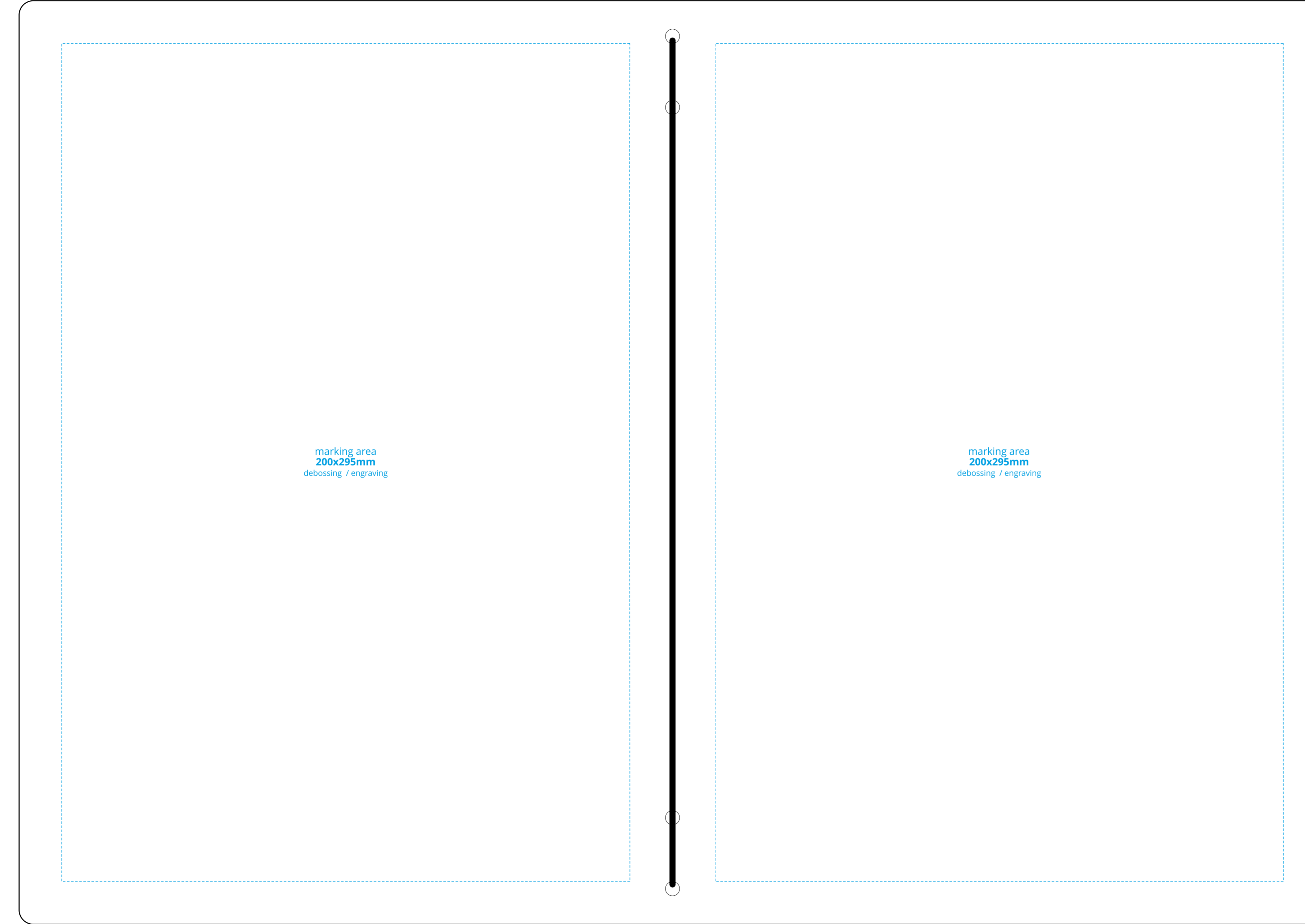
1178(A4) - inside