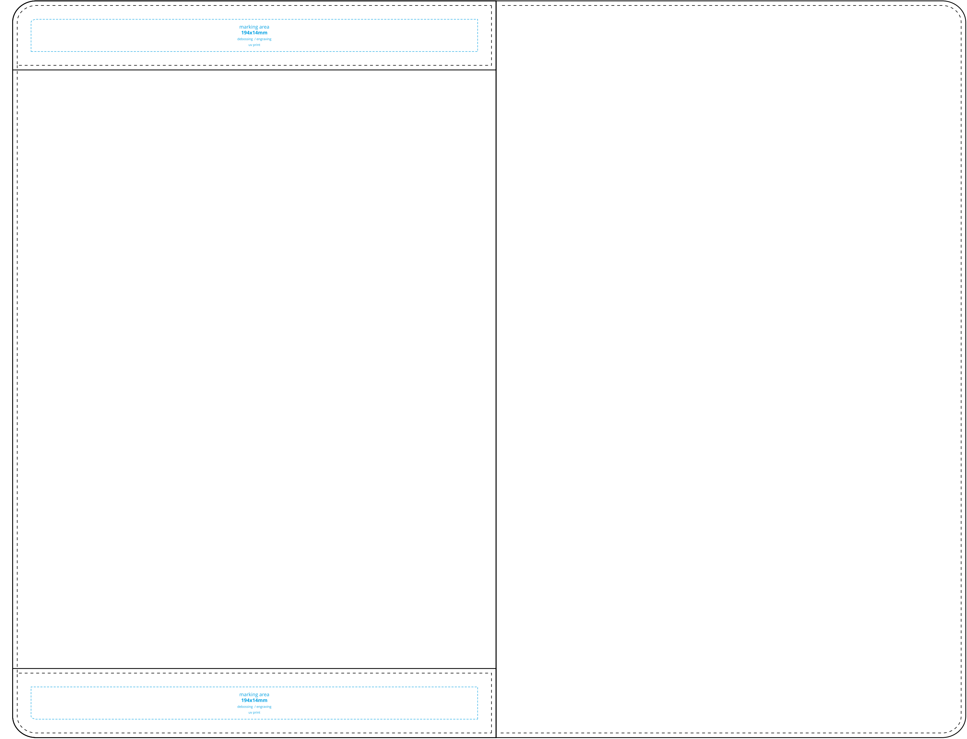
1084(A4) - inside